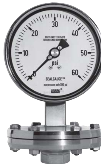
Diaphragm Pressure Gauge Model 432.56

Additional error when temperature changes from reference temperature of 68°F (20°C) ±0.8% for every 18°F (10°C) rising or falling. Percentage of span.